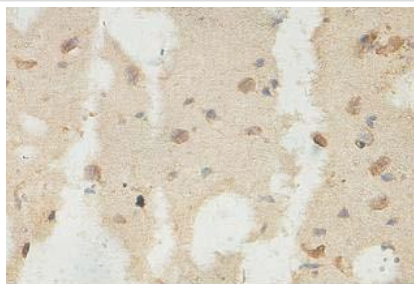
Immunohistochemical staining of formalin-fixed paraffin-embedded fetal brain showing nucleus staining with anti-ZNF300 antibody at a dilution of 1/100.