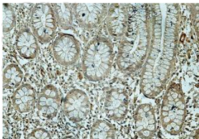
Immunohistochemical staining of formalin-fixed paraffin-embedded fetal colon showing cytoplasmic staining with anti-ZNF561 antibody at a dilution of 1/100.