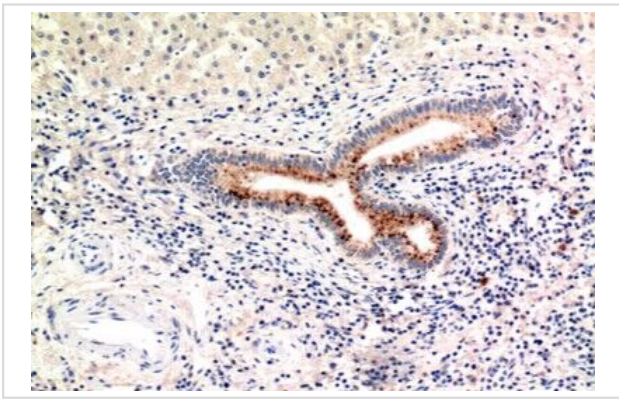
Immunohistochemical analysis of paraffin-embedded human-liver, antibody was diluted at 1:100

Note: This product is for in vitro research use only and is not intended for use in humans or animals.