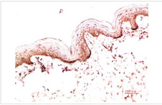
Immunohistochemical analysis of paraffin-embedded Human Skin Tissue using Collagen I Mouse mAb diluted at 1:200.

Note: This product is for in vitro research use only and is not intended for use in humans or animals.