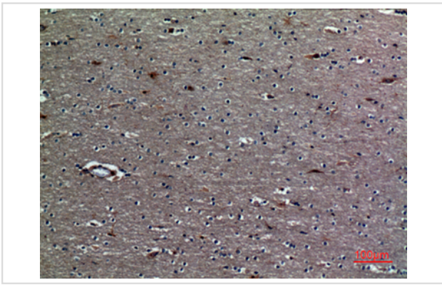
Immunohistochemical analysis of paraffin-embedded human-brain, antibody was diluted at 1:100

Note: This product is for in vitro research use only and is not intended for use in humans or animals.