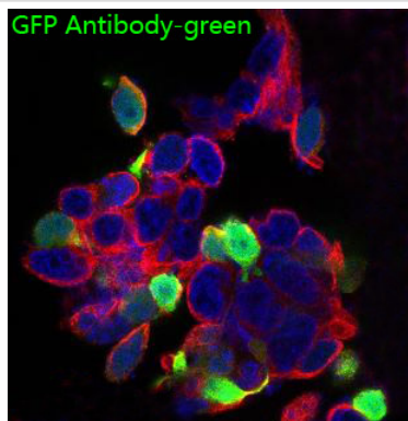
Immunofluorescent analysis of 293 cells, using GFP Antibody