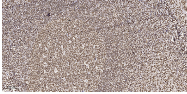
Immunohistochemical analysis of paraffin-embedded human tonsil.

Note: This product is for in vitro research use only and is not intended for use in humans or animals.