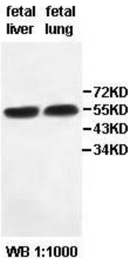
Western Blot analysis of fetal liver and lung Lysate with anti-IFIT2 antibody